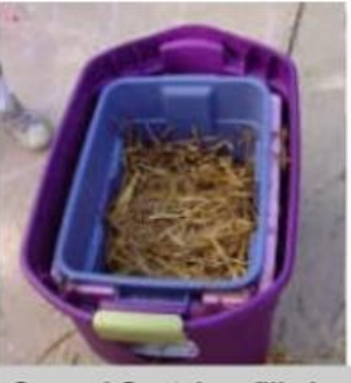
Second Container filled with Straw