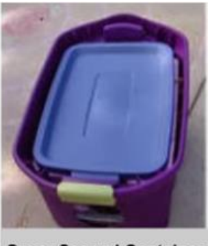
Cover Second Container