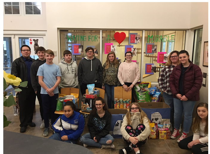
A generous group of Thomas Hunter Middle School Business & Finance students collected pet food and supplies. They visited the shelter in February to present the donation and enjoy a tour.