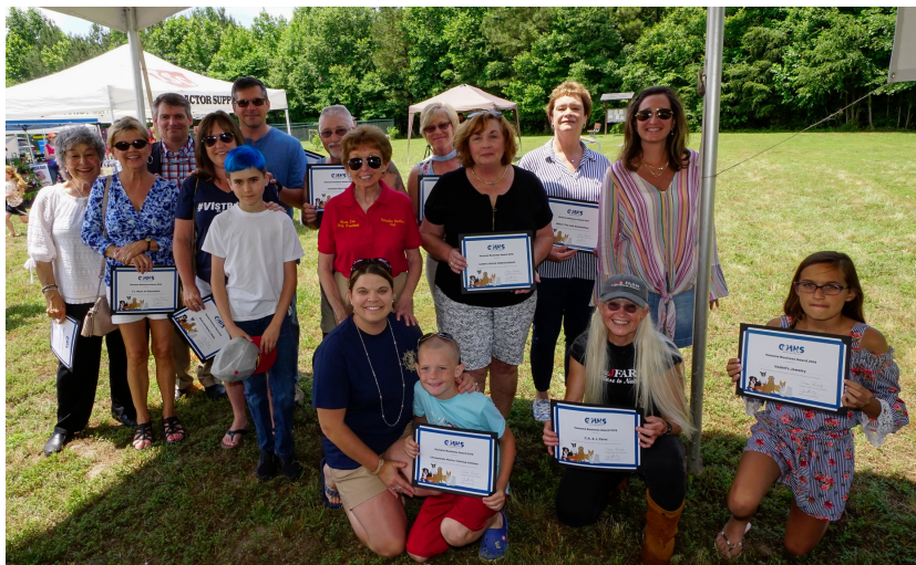
Humane Business Award recipients gather for a photo after the awards ceremony. Recipients hailed from as far away as Texas and as near as Gloucester Courthouse.

JANUARY 25, 2020 THE GOLDEN PAWS 2020 GALA AND AUCTION ABINGDON RURITAN CLUB